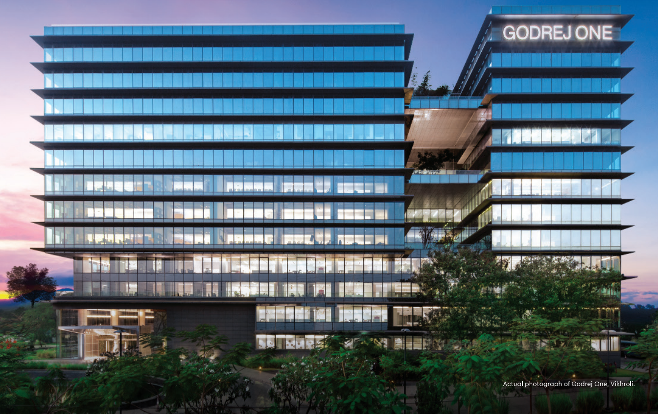
Actual photograph of Godrej One, Vikhroli.

The Godrej story began in 1897, with the manufacturing of locks. Since then, we have set several benchmarks. From a state-of-the-art manufacturing facility in a suburb of Mumbai, we've reached homes, offices, industries and the hearts of millions of people in India and around the world. With a proud tradition of many firsts, we find ourselves at work every day, building on the foundation of trust that was laid 126 years ago. Today, the Godrej Properties portfolio has grown by leaps and bounds. With a strong foothold in Mumbai and an ever-increasing consumer base, we are one of the most sought-after names in the real estate industry.